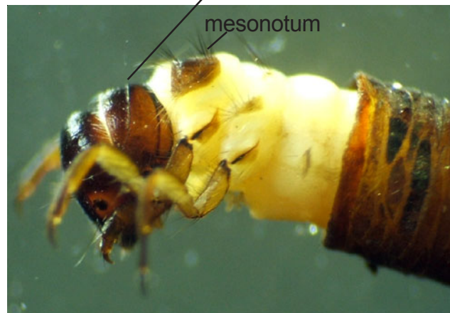
Lateral view of pronotum and mesonotum

Note: Brachycentrids are usually small members of the Trichoptera order.