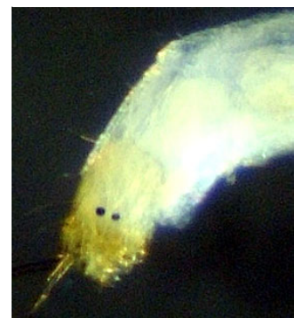
Tanytarsini head with long antennae

Note: Chironomidae and Simuliidae are the most common Diptera found in Traverse Creek.