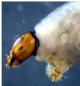
Diamesinae showing head and anterior proleg