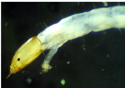
Tanypodinae showing head and anterior proleg